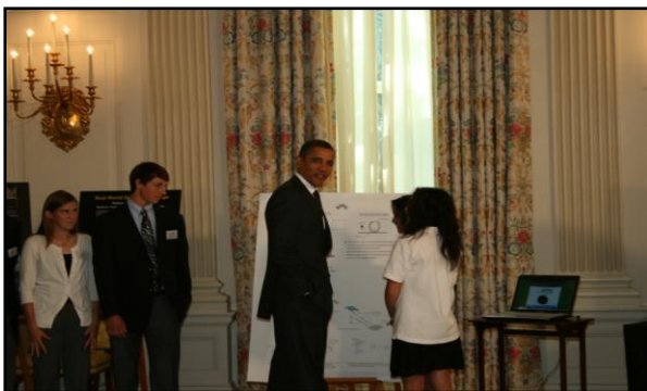
President Obama review the RWDC 2010 National Winner's Work at the White House

The Real World Design Challenge partners bring a broad base of resources and expertise from business, government, and academia. The RWDC students have received recognition for their work from leaders in government, industry and education.